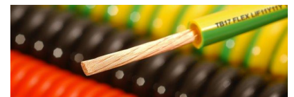
Photographs are for illustrative purposes only

Cable type : LiF11Y11Y 1x2,50 mm 2 TB17 FLEX Stranding : 322x0,10 mm bare copper wires Conductor insulation : PUR Conductor colours : transparent Overall sheath : PUR Colour : yellow/green Temperature range : -40 °C to +70 °C